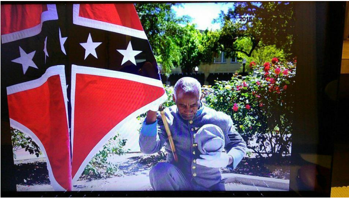
HK Edgerton Photo